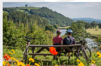
Crook O' Lune