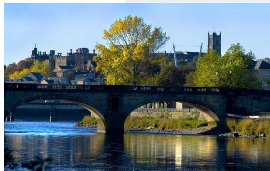
The Historic City

Despite being a university city and home to 138,000 people, over two thirds of Lancaster is classed as rural area. Surrounded by many pretty villages, it is a very pleasant place to live. Lancaster benefits from excellent rail and road links, indeed the school is easily accessed from the M6 motorway. The city offers the usual attractions of a vibrant place to live, but also has some beautiful areas of outstanding natural beauty on the doorstep. The coast is easily accessed; Blackpool, the beautiful Fylde Coast and Morecambe Bay are within 40 minutes' drive. The Lake District is 30 minutes away. Liverpool and Manchester are less than 1 hour away. London is less than 3 hours away by train, with Lancaster being a mainline west coast station, giving easy access to Scotland.