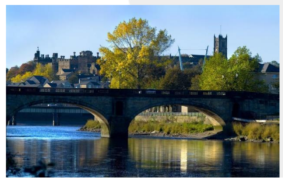
The Historic City

Despite being a university city and home to 138,000 people, over two thirds of Lancaster is classed as rural area. Surrounded by many pretty villages, it is a very pleasant place to live. Lancaster benefits from excellent rail and road links, indeed the school is easily accessed from the M6 motorway. The city offers the usual attractions of a vibrant place to live, but also has some beautiful areas of outstanding natural beauty on the doorstep. The coast is easily accessed; Blackpool, the beautiful Fylde Coast and Morecambe Bay are within 40 minutes' drive. The Lake District is 30 minutes away. Liverpool and Manchester are less than 1 hour away. London is less than 3 hours away by train, with Lancaster being a mainline west coast station, giving easy access to Scotland.