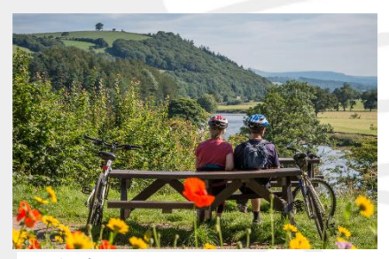
Crook O' Lune